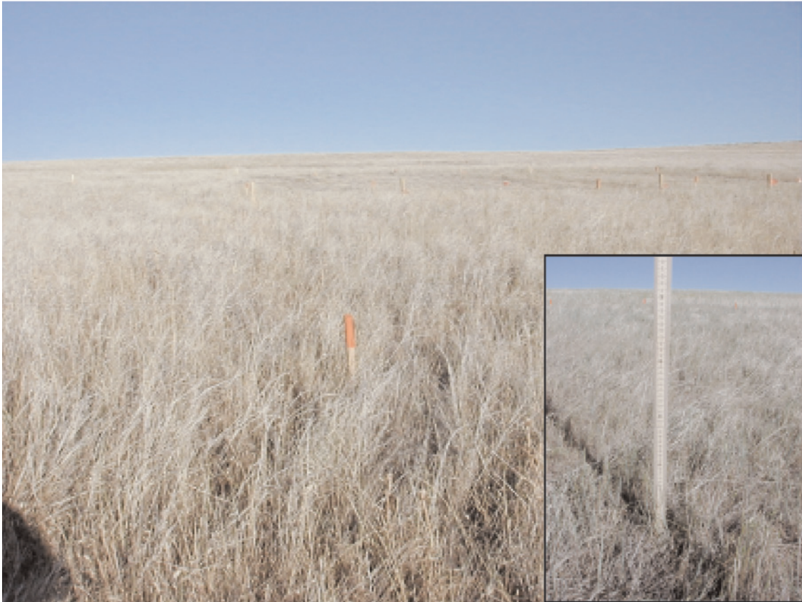
Fig 2. Clayey ecological site in 15-17" precipitation zone. The larger picture was taken in July during the 2002 drought. Western wheatgrass in normal years will grow 12-18 inches, previous year's growth is the standing dead seen in the photo; during 2002 it only grew 8 inches, as seen in inset photo taken in June.